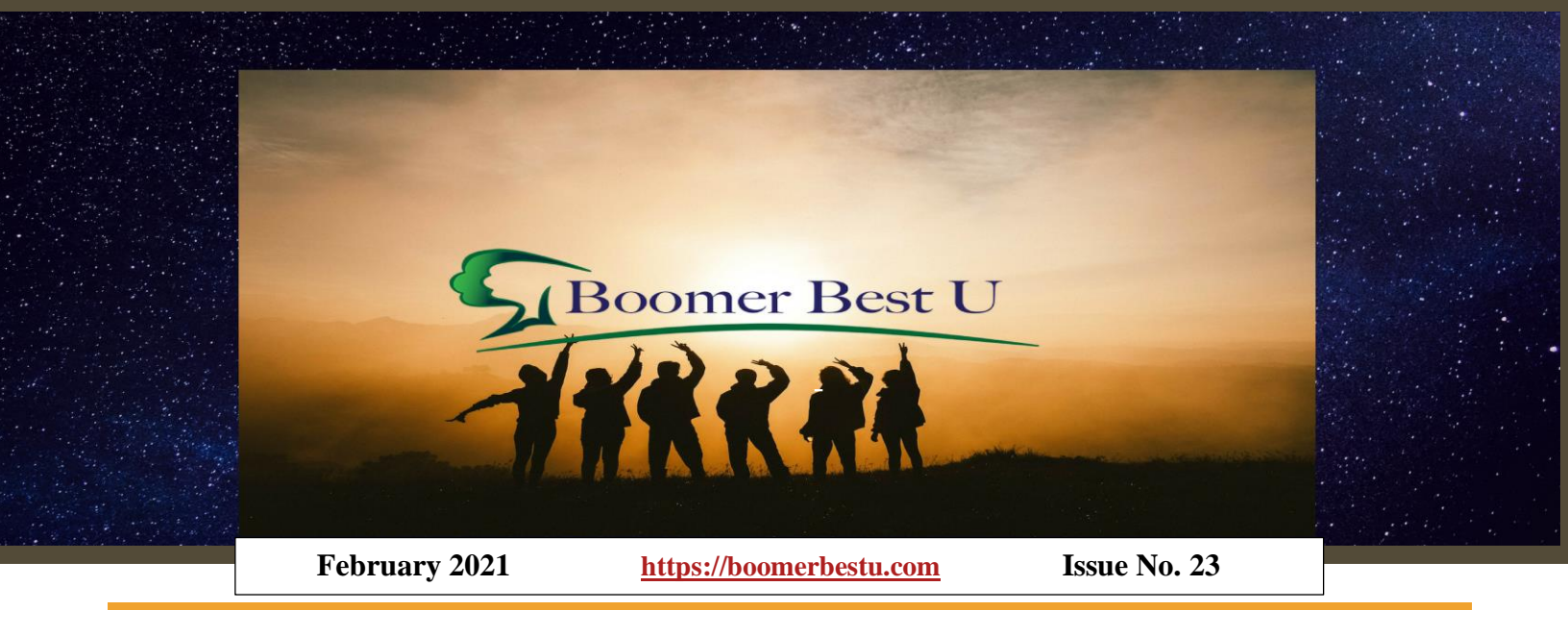
50+Living our best lives now and in the future!