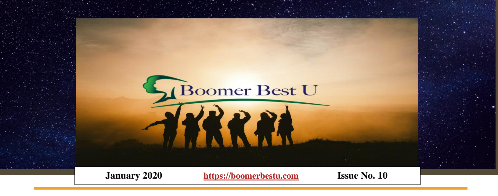
50+Living our best lives now and in the future!