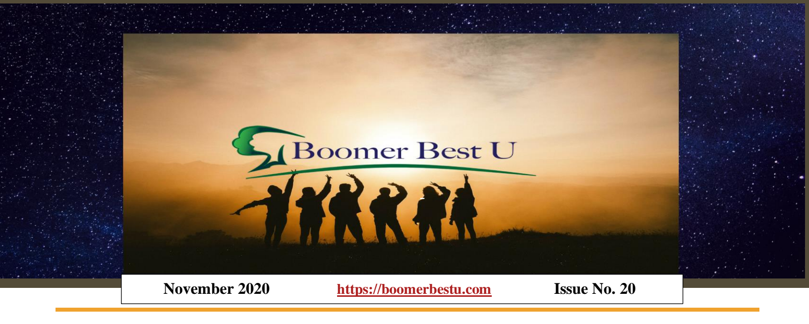
50+Living our best lives now and in the future!